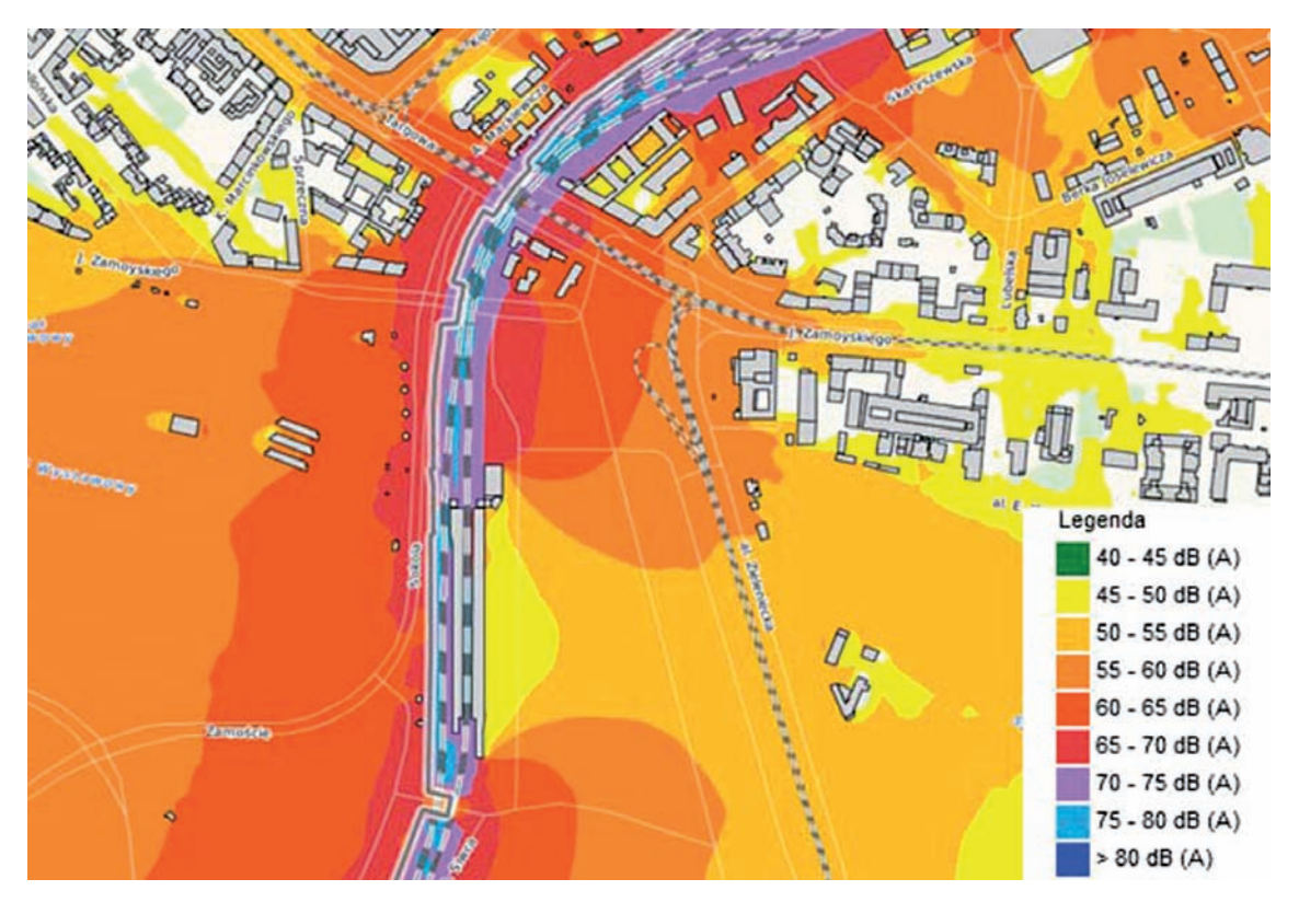
Fig. 2. Example map of a railway line with noise level distribution (isolines) [49]

The railway line may cause a nuisance in the neighbouring noise-protected areas like single- and multi-family housing development areas, developed areas associated with a permanent or temporary stay of children and youth, hospital premises, social care homes and spa protection areas. Excessive and prolonged exposure to noise can lead to mental and physical health problems in addition to discomfort.